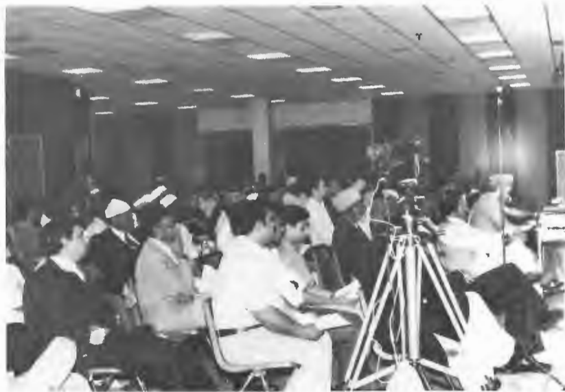
A section of the participants of the Convention