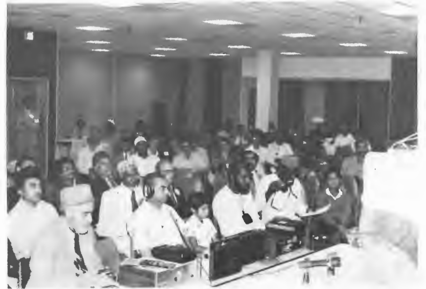
A section of the participants of the Convention