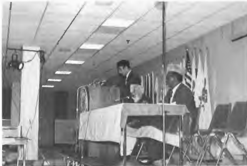
Sahibzadah Mirza Muzaffar Ahmad delivering the Inaugural Address